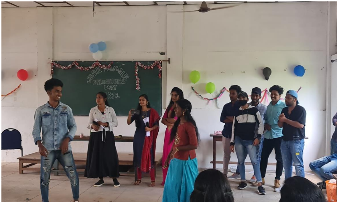
STUDENT'S PROGRAM HALL