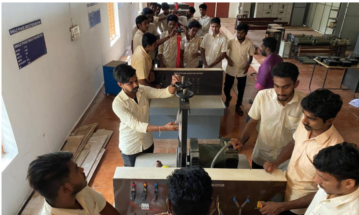
DC MACHINES LAB