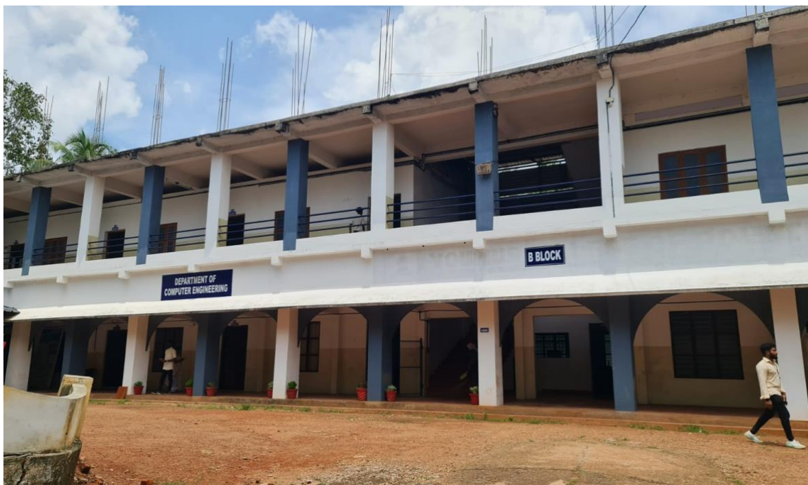
BLOCK B: DEPARTMENT OF COMPUTER TECHNOLOGY