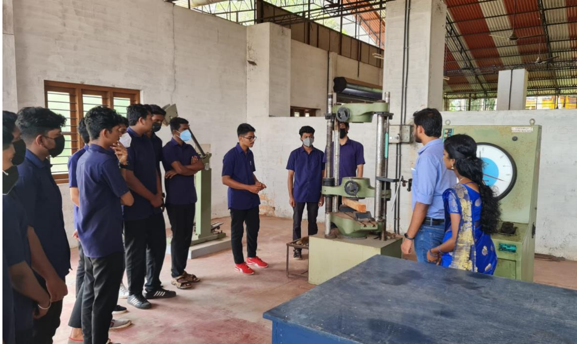
MATERIAL TESTING LAB