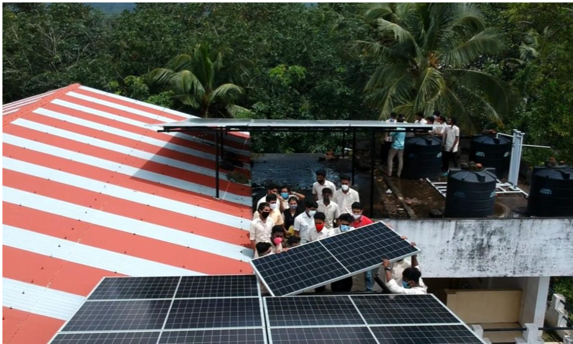
STUDENT'S SOLAR PROJECT