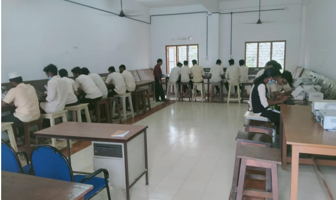
ELECTRONIC CIRCUITS LAB