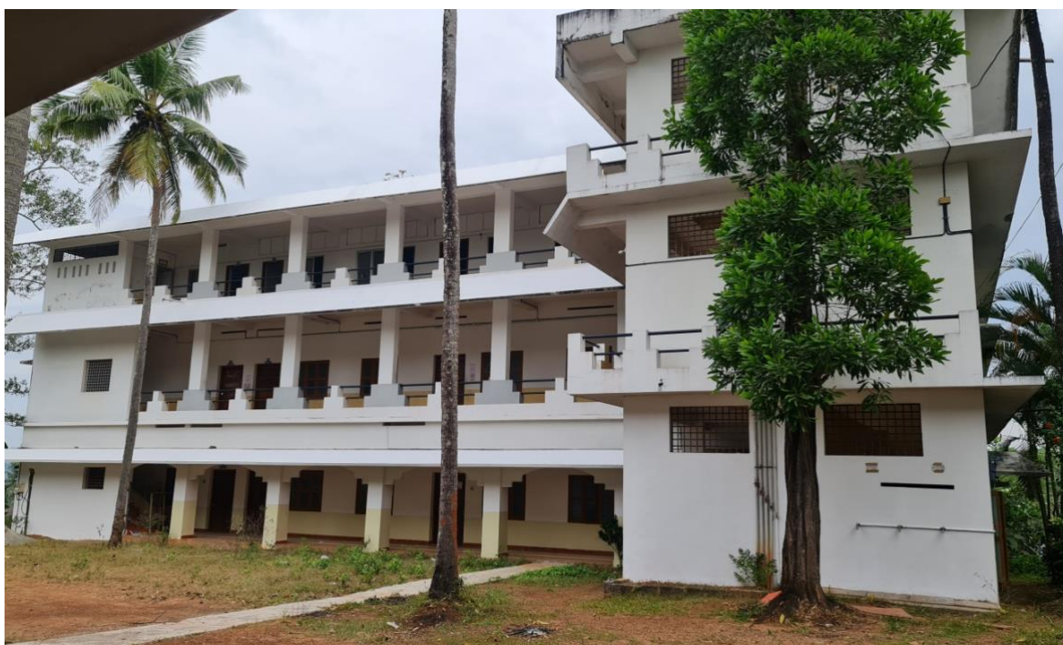
BLOCK C: DEPARTMENT OF ELECTRICAL AND ELECTRONICS ENGINEERING