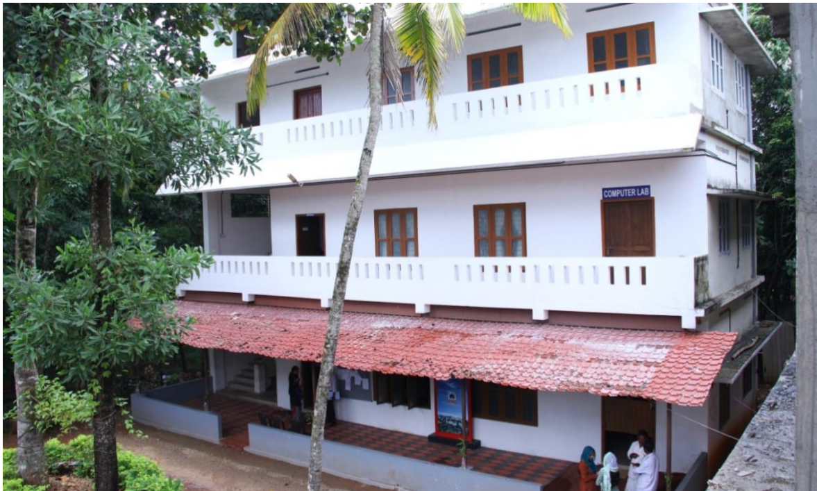
BLOCK A: ADMINISTRATIVE BLOCK